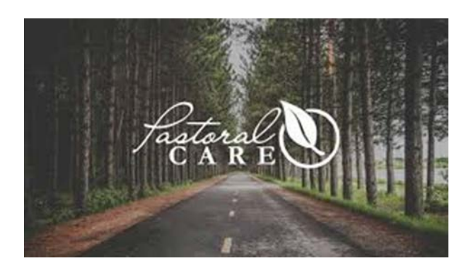
PLEASE LET US KNOW IF SOMEONE NEEDS A HOME VISIT

Green: The evergreens of the Advent Wreath and the green on our Christmas trees and wreaths are everywhere. Green is associated with life; the greenery we display reminds us of the promise of life that Christ offers us by his birth on Christmas Day.